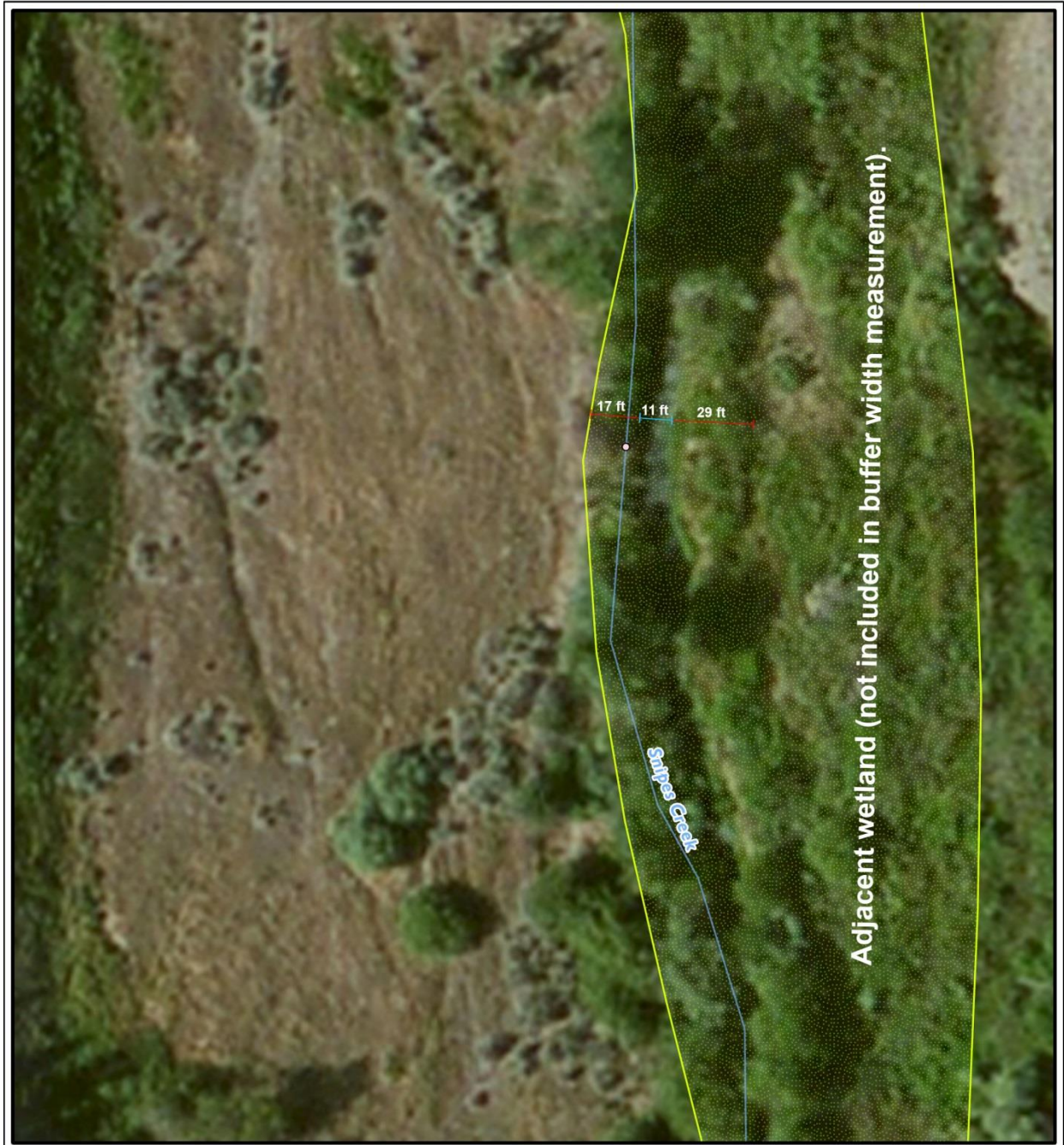
Figure 2: Riparian Buffer Measurement with Adjacent Wetlands

continuous stream, there are variations in buffer width that are not captured. In many locations, there are wetlands adjacent to the stream, which increases the apparent width of riparian vegetation. Because wetlands receive separate protections under the Benton County regulations, some mapped wetlands adjacent to riparian buffers were excluded from the buffer measurements, as shown in Figure 2.