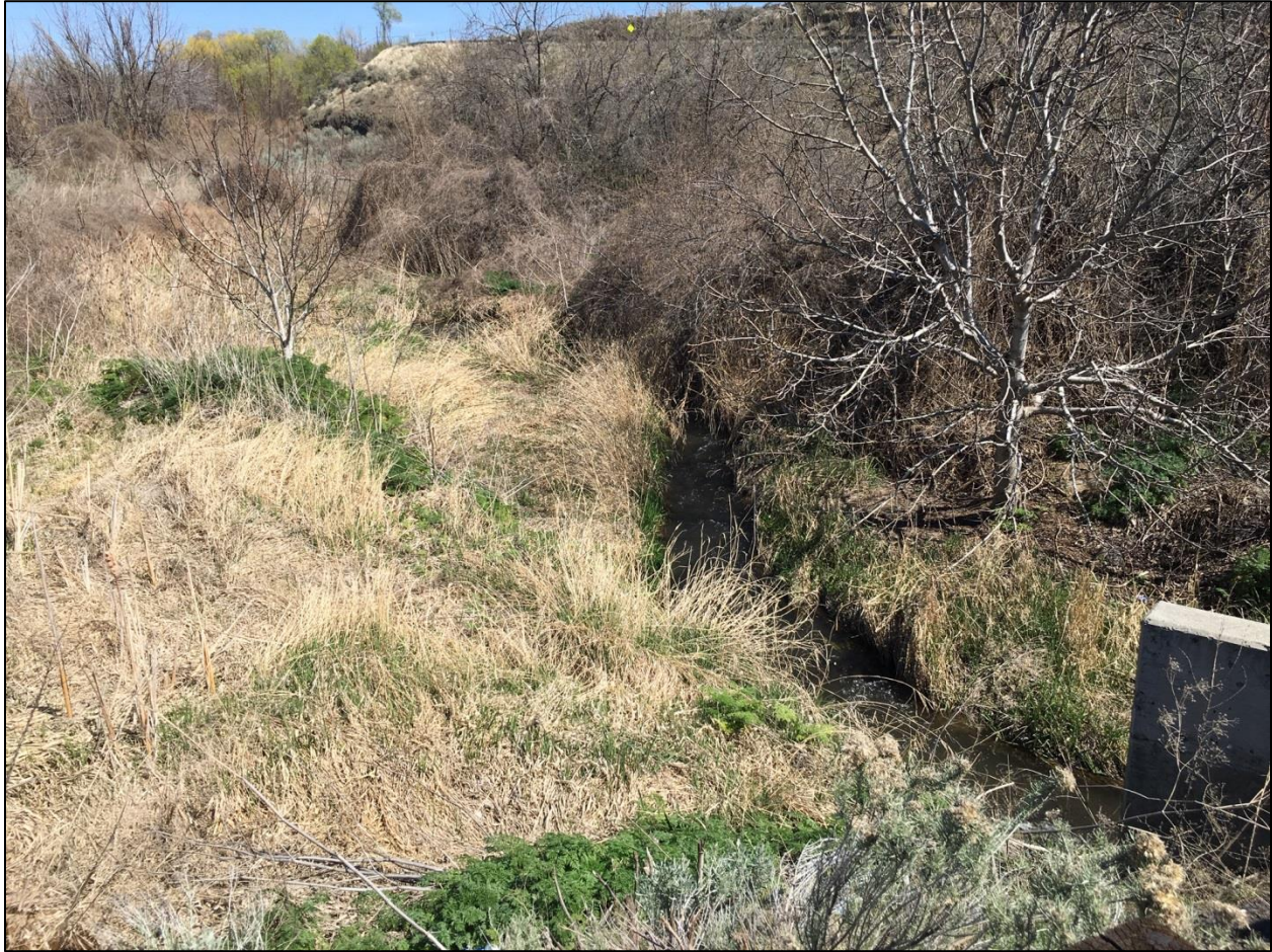
Corral Creek Channel and Riparian Vegetation – April 9 th 2020.

A field visit was conducted in April 2020 to verify the buffer measurement methodology at several publicly accessible sites. Actual stream and riparian buffer widths were measured with a tape and compared to widths calculated with aerial imagery. Riparian vegetation types measured in the field were cross referenced with those identified in aerial imagery to verify accuracy.